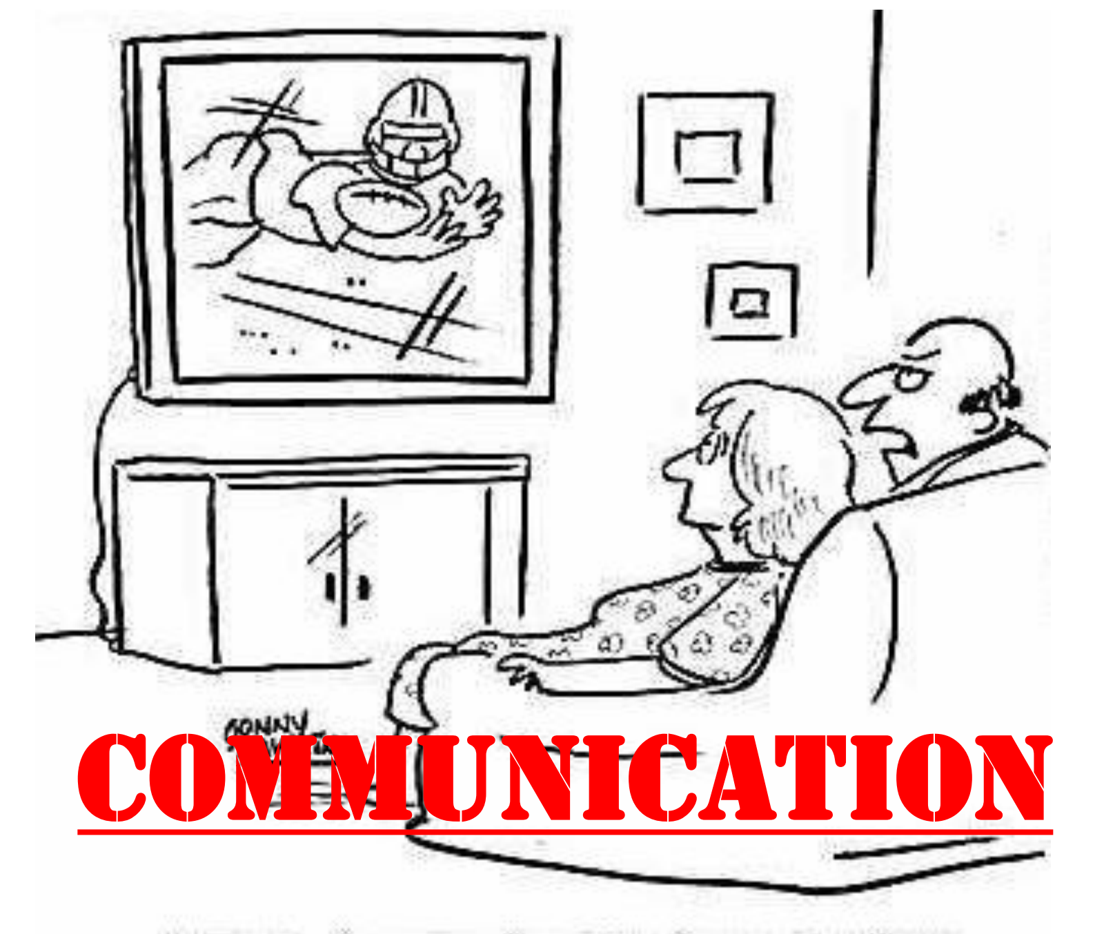
"He's the 'receiver', not the 'receptionist'."